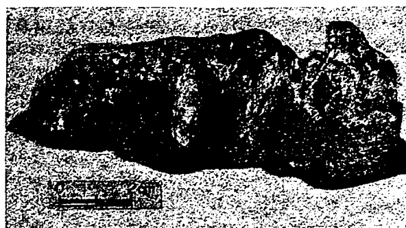
Fig. 3—Part of a meter long tree log encrusted with wood borers.

Mangroves being intertidal, the position of sea level has to be considered to study the plant rich sediments which were deposited under marine conditions. It is well established that the global sea level was low (-120 m) at 18,000 years BP and rose rapidly since then 15 . Along the west coast of India, the eustatic sea level rose at a very high rate from 10,000 to 7,000 years BP after which it almost stabilised 16 . The horizons where peat was deposited