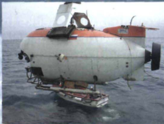
Submersibles will be deployed for the census (left)