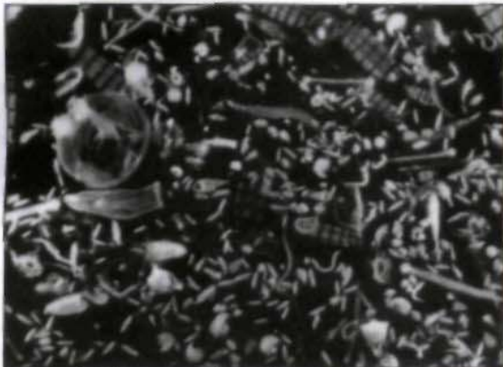
Typical zooplankton community. Catch from Indian Ocean

oceanic waters from surface to abyss. By 2010, CoML field projects will integrate and synthesise their discoveries and conclusions and produce a new global view of the diversity of life in the ocean.