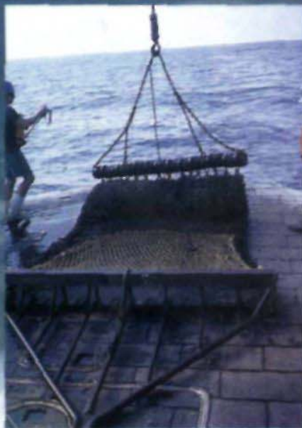
Scientists and crew sort through the massive amount of specimens (left)

Advances in technology lift limits for discovery of life that is small, deep, or rare. Census scientists are innovating, refining, and integrating techniques to assess and monitor marine life.