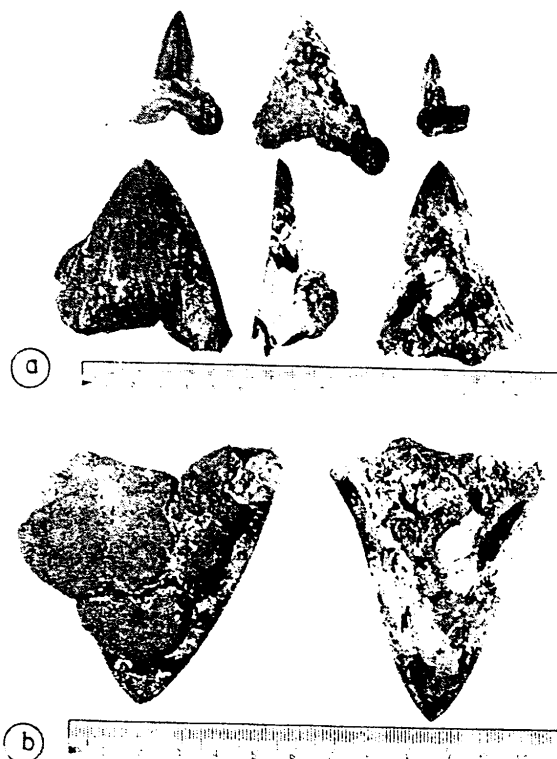
Fig. 1—a) Representative specimens of sharks' teeth recovered from the Central Indian Ocean Basin, of varying shapes, sizes and thickness of Fe-Mn oxides. b) Two large sharks' teeth with the one on the left substantially encrusted while the basal part of the tooth at the right is filled with altered basaltic material. Scale in cms.

similar to the observation made of sharks' teeth recovered from other locations in the CIOB 11 .