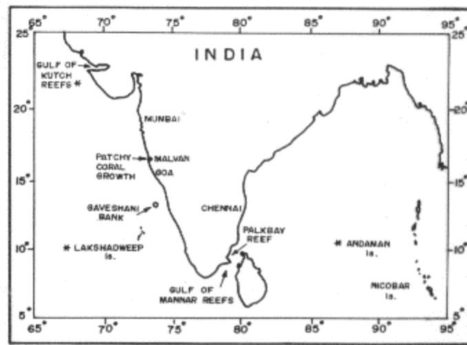
Figure 1. Location of sampling sties.

Necrotic lesions were observed very frequently in Porites lutea which is common in the lagoons of Kavaratti and Kadamat islands. The disease is characterized by the presence of single or multiple necrotic patches on coral colony. Two types of necrotic patches were observed. In one type, the patches were surrounded by healthy polyps (Figure 2 a). This type occurred mostly on the upper side of the corals. In the second type the lesions occurred at the bottom of the coral in contact with the sediment and these lesions were not surrounded by healthy tissues. The necrotic patches