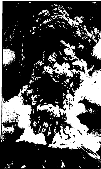
Differentiation of the mantle continues in regions of volcanic activity

In 1715, Edmund Halley suggested that the age of the ocean and thus that of the world can be estimated from the rate of salt transported by rivers. Using this method John Jolly in 1899, gave an age of some 90 million years. A. L. Lavoisier conducted the first analysis of seawater by fractional crystallisation thereby obtaining a se-