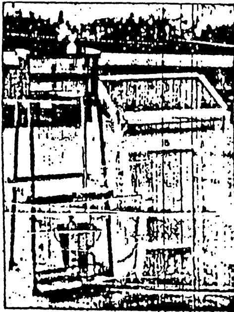
Fig. 1 (b) : Experimental set up to study the improvement in efficiency of multi-surface solar still.