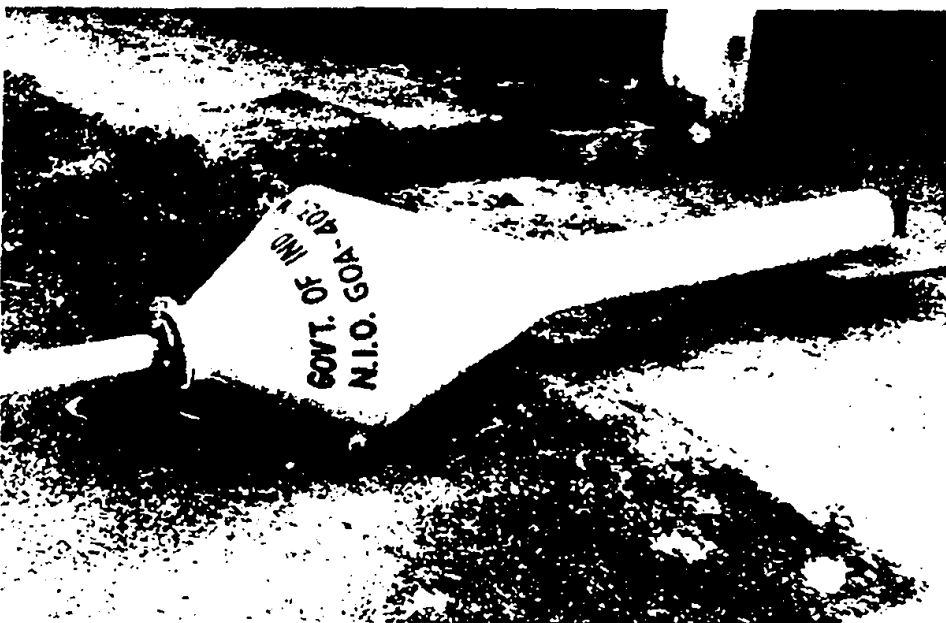
Fig. 3. — The NIO drifting buoy

Programmatic considerations indicate deployment logistics, scientific sampling requirements needing the buoys to remain operational for a long time and cost as the major factors in the use of drifting buoy systems. Oceanography does not seem to have a good record in moving techniques and instruments into the commercial sector for marketing and further development. Specialized designs and the need for elaborate logistic support are among the reasons. Small potential markets and high overheads make the oceanographic measurement systems unat-