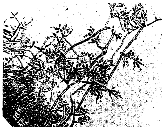
Fig. 4. Photomicrograph of Trichoderma pseudokoningii