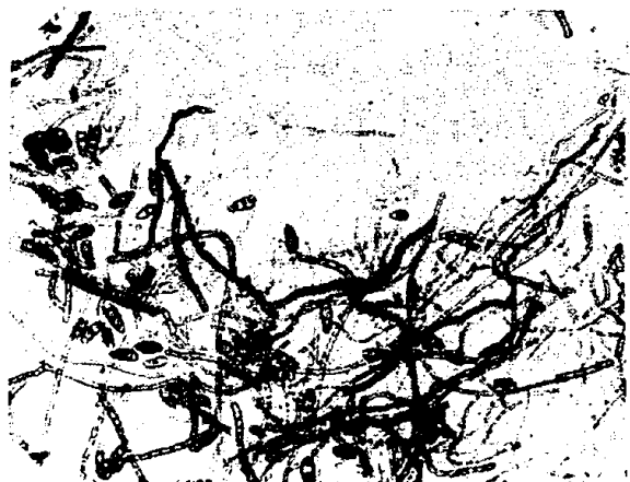
Fig. 2. Photomicrograph of Curvularia lunata

Yps's agar medium (Kohlmeyer & Kohlmeyer, 1979) and incubated at 28 \pm 2^\circ\text{C} . After 48 h of incubation fungal growth appeared under and at the edges of the slides. These colonies were isolated on Yps's slants and identified. The study was carried out during the pre-monsoon, monsoon and post-monsoon periods. Hydrography of the test sites was also studied simultaneously (Strickland & Parsons, 1968).