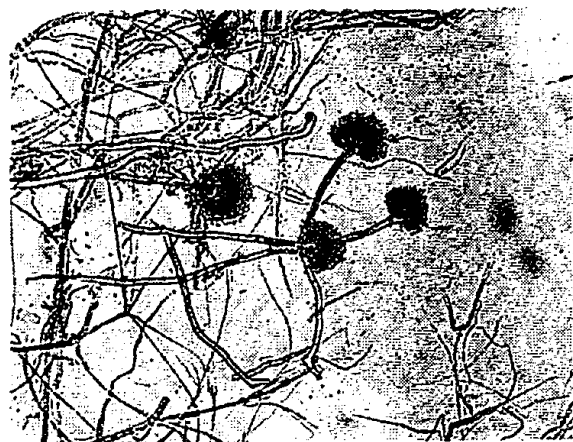
Fig. 3. Photomicrograph of Aspergillus terreus

Curvularia lunata (Fig.2) showed its settlement on the slides throughout the year, at all the three periods irrespective of the salinity levels. The fungi Aspergillus terreus (Fig.3), Trichoderma pseudokoningii (Fig.4) and Phomopsis spp. were isolated from the glass slides during the monsoon period only, when the salinity fluctuated between 19.00 to 0.8‰, and appear to be euryhaline. All these fungi are terrestrial forms known