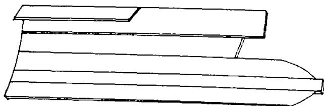
Fig. 1 : Joining of Wooden Plank of Nauka