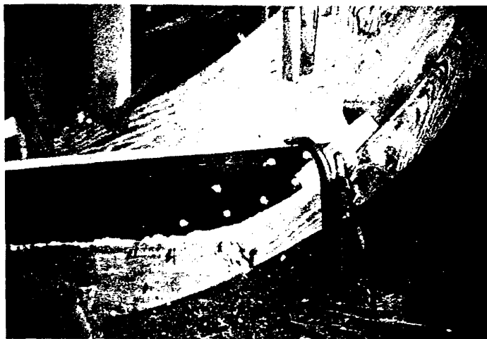
Plate 1 : Outrigger on starboard side of a canoe, Belekeri