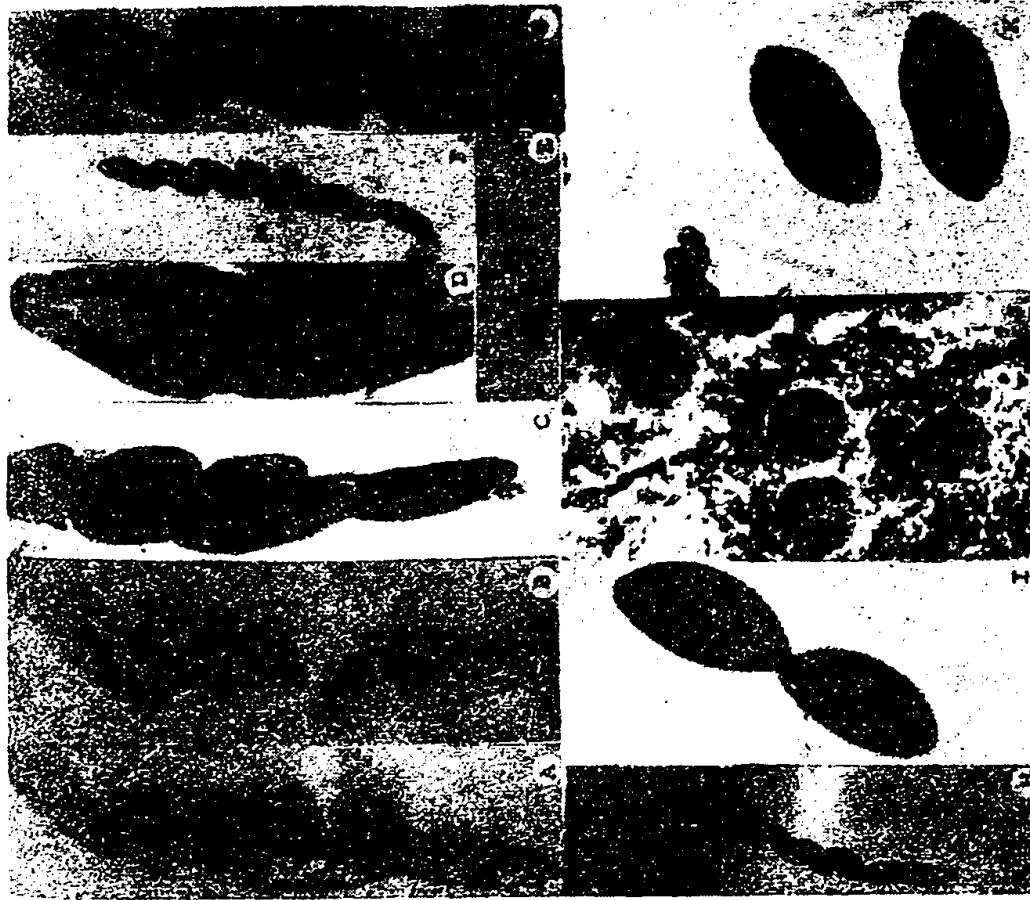
Fig. 1. Rhizophila marina : ascus-1200 X (A), ascospore-1200 X (B). Trematosphaeria striatispora : ascus-400 X (C), Ascospore-4000 XD. Hydronectria telhys var glabra ascospore-1200 X (E) Lineolta rhizophorae : ascus-400 X (F), ascospore-1200 X (G). Hypoxylon occanicum : ascus-400 X (H), ascospore-1200 X (I). Caryospora rhizophorae : ascocarp-160 X (J), ascospore-1200 X (K).