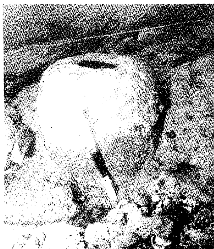
Fig. 2 : Spheroid stone artefact with a hole. Somnath waters.