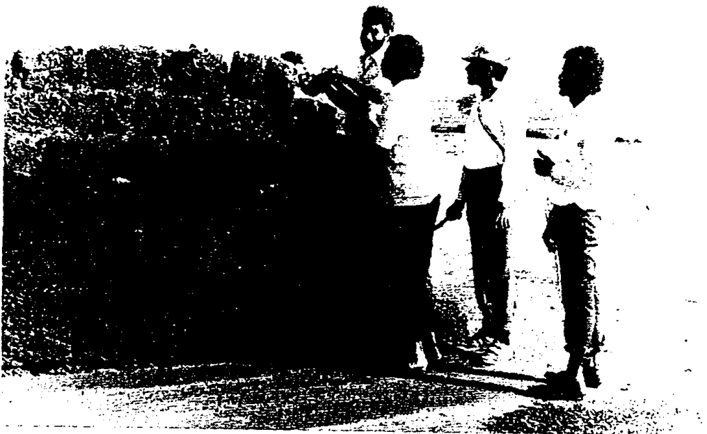
Fig. 3. Remains of a stone wall of Gopakapattana post