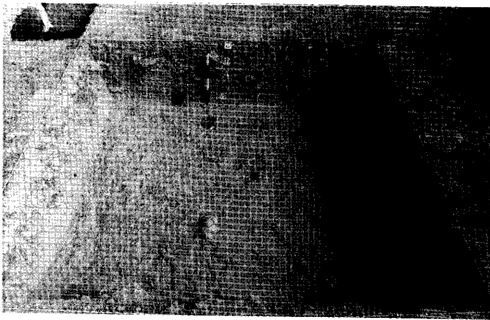
Fig. 3 : Trench 1 excavated in the terrace above intertidal zone at Bet Dwarka