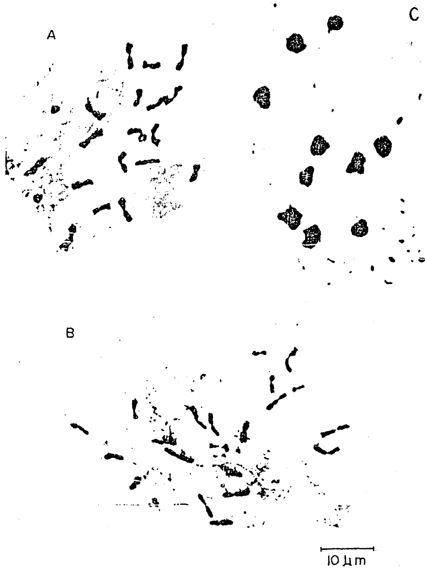
Fig. 1. A & B: plates showing 20 somatic metaphase chromosomes. Fig. 1. C: meiotic metaphase-I, showing 10 bivalents.