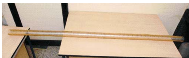
Figure 2. Special core liner (spcl) of 2 m, prepared from 1 cm rings/sections using packing tape.

could leak, mix or fall apart from the spcl. At the end, all the rings of the spcl were cleaned, washed and air-dried for reuse.