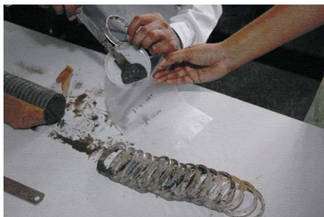
Figure 4. Sediment sub-sample (1 cm) being removed from spcl.

parameters. Later, the spcl was modified for improving intervals @ 1 cm and to suit real-time sub-sampling of gravity core sediments. Accordingly, 2 m long spcl was tested successfully on board ORV Sagar Sukti in April 2007. The vessel has the capability to operate only 2 m long gravity corer. The on-board test showed that the spcl method of sub-sampling the aqueous sediments has many advantages over the existing methods. During the entire operation, the sediments inside the spcl were intact and