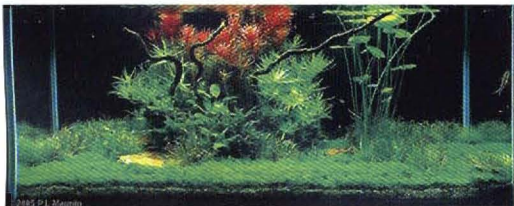
Fig.5: A Zen Aquascape.

Medium Aquatic Plants (15-30 cm): These plants are suitable for midground are: Amazon Frogbit ( Limnobium laevigatum ), Giant Anubias ( Anubias barteri ), "Coffee Leaf" Anubias ( Anubias barteri 'coffeefolia'), Blyxa Echinosperra ( Blyxa echinosperra ), Blyxa Japonica ( Blyxa japonica ), African Water Fern ( Bolbitis heudelotii ), Cyperus