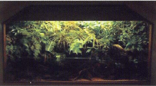
Fig.3: A German open style/ Paludarium at Hans Paludariums.