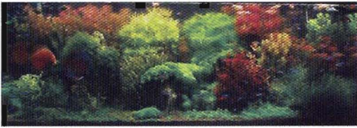
Fig.1: A Dutch style aquascape. This aquascape was made by Shyn Fertig, Israel (Image under free license of Wikimedia)