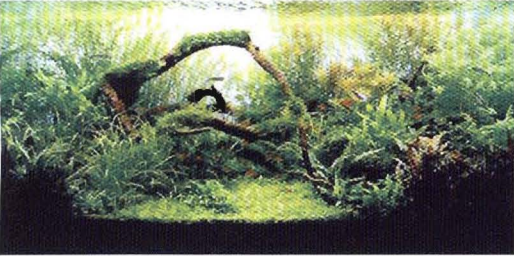
Fig.2: A nature Aquascape by Japanese aquascaper Takashi Amano.