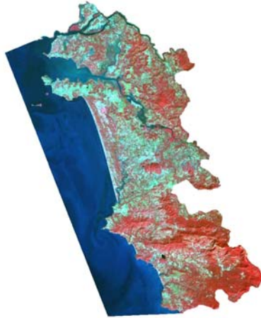
Figure 1 Satellite image view of study area

constitutes swamps, mangroves, mudflats, river terraces and island.