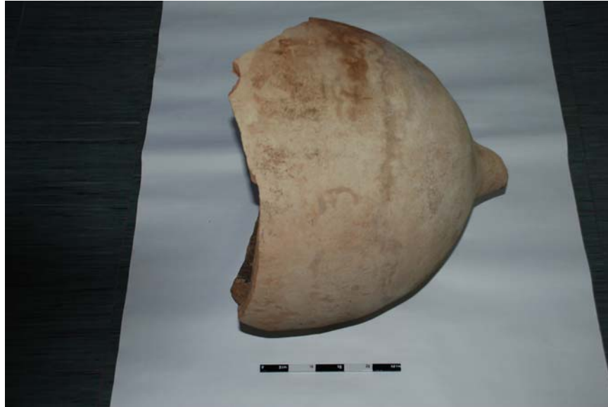
Figure 4. Kaj: Lower portion of amphora, the remnant of Indo-Roman trade.

presence of Harappan and late Harappan settlement within close proximity, for example, Nageshwar and Bet Dwarka near Okhamandal Dwarka, Kindar Kheda near Mul Dwarka (Visawada) and Kanjetar and Kaj near Mul Dwarka (Kodinar). All the three Dwarka have ancient temples dated to the 10 th -12 th century AD. Nonetheless, these sites were ancient busy ports and perhaps temples were served as coastal marker point for navigator and also they worship before embarking on the long voyage.