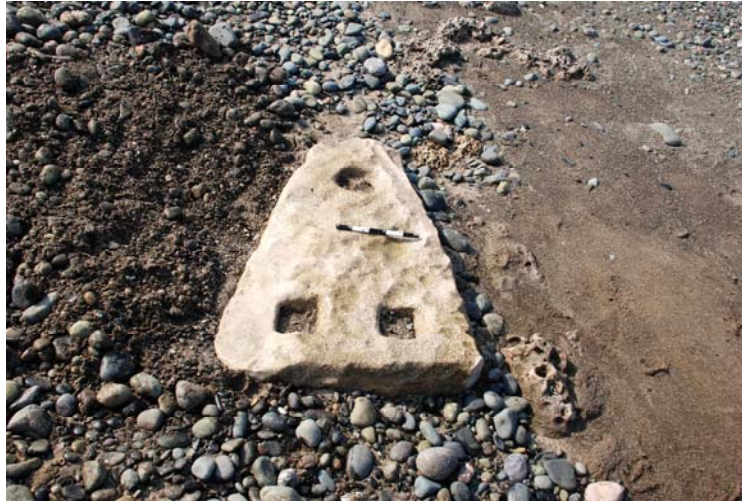
Figure 3. Mul Dwarka: Composite stone anchor from Inter tidal zone.

The offshore exploration in Mul Dwarka region revealed uneven rocky and sandy patches as major observation of seabed topography. The exploration revealed a few stones possibly used as anchors for small boats but they are not similar to those anchor found from inter tidal zone of Mul Dwarka and other places on the Saurashtra coast. There is possibility that ancient anchoring point might have been vanished during the construction of new jetty.