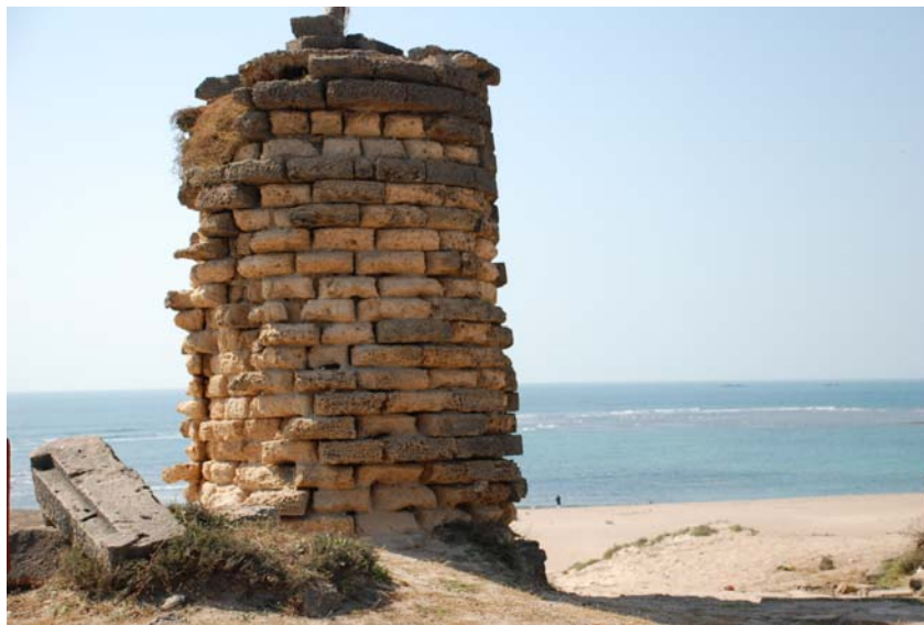
Figure 2. Mul Dwarka: Ancient Lighthouse on the coast.

A small coastal village known as Mul Dwarka near Kodinar in the district of Junagad is one of the claimant of the original Dwarka of Mahabharata. The proximity with Junagadh hills on the north and sea on the south the town has been associated with Dwarka (Sankalia, 1966). An ancient temple is situated on a raised land close to the sea. The temple is in dilapidated condition and is not under worship. The shrine is dated to the post 10 th century AD (Sampura, 1968). A circular structure of about 4 m in height constructed with similar type of dressed limestone blocks (Figure 2) as of the temple is situated close to ancient temple. Locally this structure is called as Diva Dandi (lighthouse). If this structure has served as lighthouse then this may be the oldest remains of lighthouse on the Saurashtra coast. Local fishermen informed that a few anchors similar to those of Indo-Arabia type were present but now they have either buried under new port or other private buildings, which cannot be noticed. An ancient well was noticed which is still used for drinking water source near the jetty.