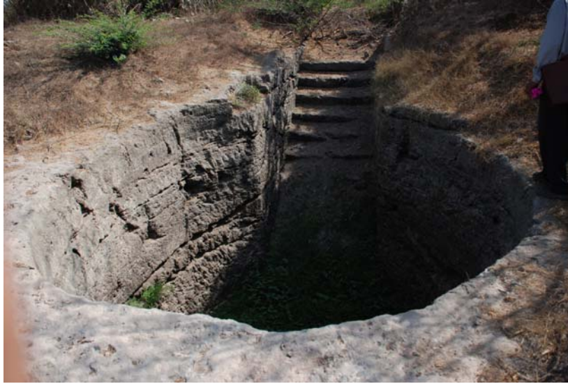
Figure 8. A Rock-cut step well close to a Historical period site at Kanjetar.

A tidal river flows on the eastern side of the village Kanjetar and at present it is blocked by a sand bar. The seabed off the river mouth is comprised of sandy and rocky patches and very similar to that found at Dwarka, Miyani and Visawada. The exploration revealed an Indo-Arabia type stone anchor from a water depth of 4 m. This is a broken and only its upper portion was traced. It has an upper circular hole. The anchor is made out of limestone. The anchor is very similar to those reported from other sites on the Saurashtra coast (Gaur et al. 2005c).