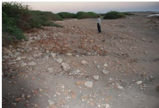
Figure 7. Chhara: A large number of rolled potsherds are spread in a large area exposed due to wave action.

The underwater exploration off Chhara was carried undertaken opposite to the ancient mound, which is located just on the coast. The seabed topography is comprised of rocky and uneven surface with water depth varies between 4 to 7 m. Two stone anchors were found from this area. The brief description of each is as follows.