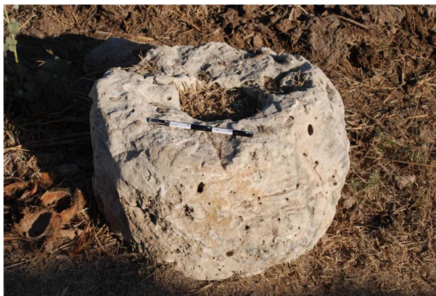
Figure 5. Kaj: Ring stone anchor lying on the outskirts of ancient site at Kaj.

Interestingly, in one of the agriculture fields a handle of an amphora was collected and a lower part of an amphora (which was found during digging of a well in the field), which served as water storage for washing hand (Figure 5) in the field before we brought to NIO. Other stone artifact worth to mention here is a ring stone type anchor (Figure 6), which was noticed just before entering to the site. This is about 50 cm in height and diameter of the same dimension with a hole through in the middle. This is very similar to those reported from Dwarka and Somnath (Gaur, et al., 2004). With the discovery of such artifacts, it is imperative to believe that Kaj was a Harappan port town and later it was an important Indo-Roman trading center on the Saurashtra coast. Morphological changes have occurred over the last several centuries, which led to abandonment of the port.