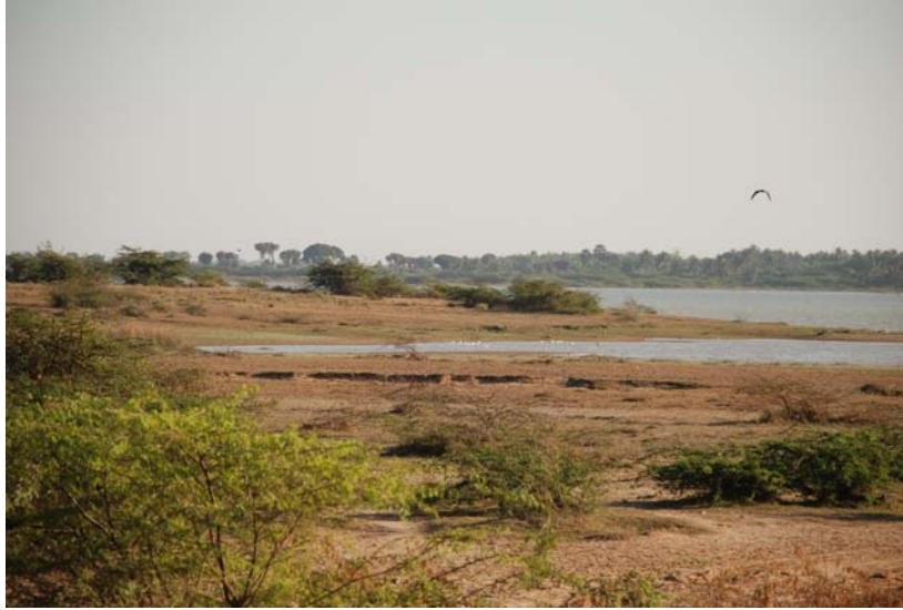
Figure 6. Kaj: Ancient site of Harappan and the Historical period is located close to the creek.