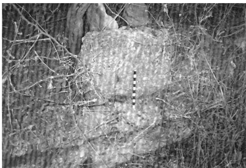
Fig. 5: Stone blocks used for fortification. Piram Island

stone artifacts were noticed in the inter tidal zone area. The largest among them are door jams (Fig. 3) numbering more than a dozen. They are circular in shape with a deep hole in the middle. These artifacts indicate that the fort had several gates all along the coast.