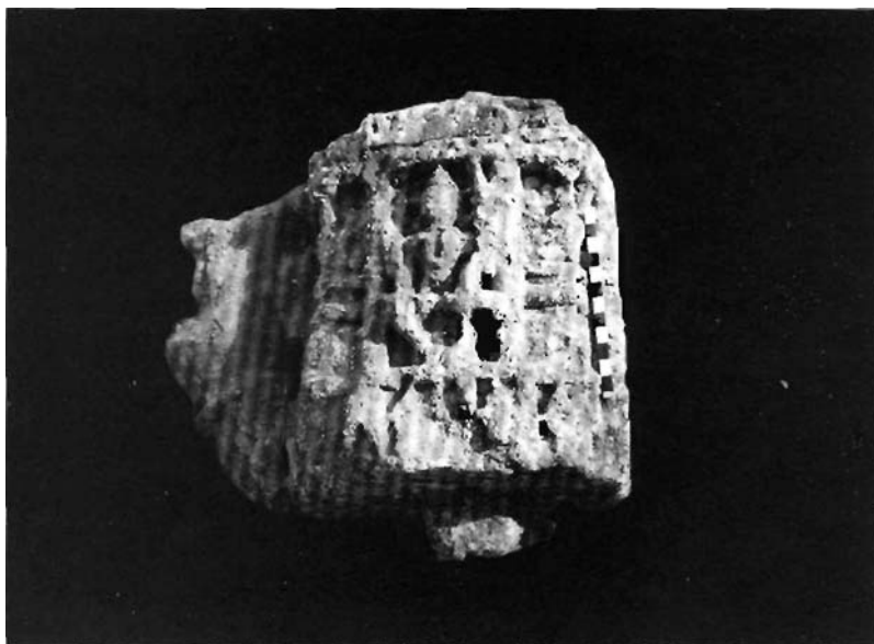
Fig. 4: Fragment of sculpture Piram Island

Being situated close to the famous historical sites such as Hathab, Gopnath, Gogha and Vallabhi, the Island of Piram was bound to have great importance for maritime activities including piracy (Bell 1980). The island has served as a marker point for the navigation in the Gulf of Khambat. Recently an onshore and inter tidal zone exploration was undertaken along the coast of Gogha and Piram Island. A large number of stone anchors were found from the inter tidal zone of Gogha (Gaur 2007) along with Islamic glazed ware. The exploration around the island revealed that Piram was surrounded with a fort as large numbers of structures are exposed in cliff sections all along the coast. Perhaps these are the remains of the fort built by Mokharji in the early 14 th century CE and used as safe shelter after pirating the ships passing through this area. The cliff sections yielded a large number of remains of walls and projections (Fig. 2). A large number of