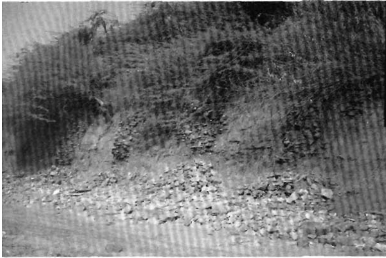
Fig. 2: Remains of walls in Cliff Section. Piram Island

The island is uninhabited except for a few personal who man the lighthouse. However, fishermen and occasionally a few tourists visit the island.