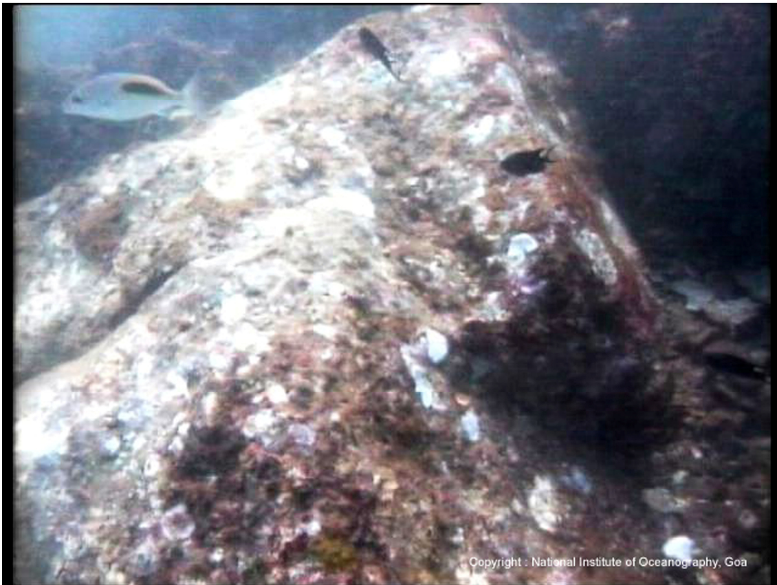
Figure 4. Stone block with a joinery projection found off Mahabalipuram

Dressed granite blocks were used for the construction of this structure. A wall about 250x65 cm with two to four courses is noticed. Huge rectangular blocks measuring approximately 2x1x1.5 m were also noticed on the central upper portion of the structure. Another wall measuring about 5.4 m in length was seen on the northern side along with two parallel walls on the southern side of the main structure, with a stair-like structure leading upwards. Further on the northern side, the remains of a wall extend up to 15 m in length. The length of some of these six walls varies from 7 to 32.5 m; the other walls being shorter in length. A floor measuring 2x2.5 m was also noticed towards the north-western side of the structure. The entire structure has thick marine growth of sponges, shells, barnacles and mussels; a few blocks were cleaned and chisel marks were observed. One of the blocks shows that it has joinery projections for interconnecting the blocks (Figure 4; Sundaresh, et al. 2004:1233).