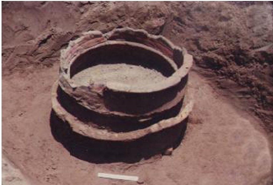
Figure 2. Terracotta ring well exposed in the intertidal zone at Poombuhar

During the course of explorations in the inter-tidal zone at Poombuhar the following were exposed: a brick structure of eleven layers running parallel to the coast with dimensions 1.2 m width, 1.2 m height and 4 m length; and a terracotta ring well with dimensions 25 centimetres (cm) high, 4 cm thick at the rim, and a diameter of 75 cm with three courses (Figure 2). Further, four brick structures of 25 m length, 3.4 m width aligned in a straight line, were noticed at a water depth of 1 m, opposite to present Cauvery temple at Poombuhar. The size of the bricks is 22x13x6 cm.