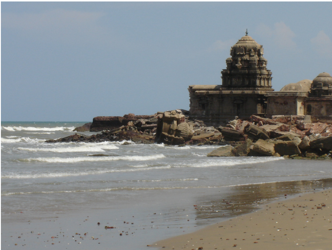
Figure 3. Partly collapsed Masilamani temple at Tranquebar

Tranquebar, a principal port during Danish rule (1620 AD-1845 AD), is situated about 15 km south of Poompuhar. The 13 th century Masilamani temple is partly collapsed and the remains are found scattered in the inter-tidal zone (Figure 3). Two brick wells were found exposed in the inter-tidal zone. There is also evidence on the destruction of modern houses due to the encroachment of the sea (Sundaresh, et al. 1997:595, 593-98).