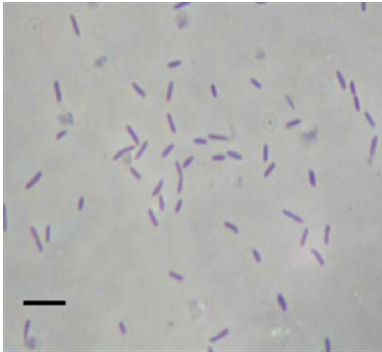
Supplementary Fig. S1