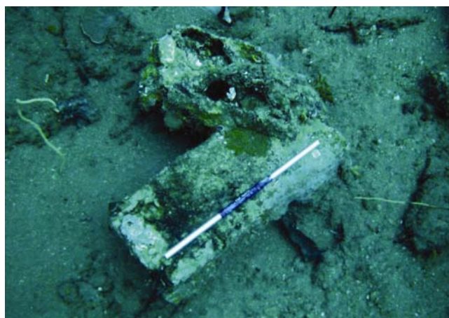
Figure 3. Four-legged stone quern in the shipwreck.