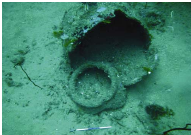
Figure 2. Large-sized jar noticed in the shipwreck.

In India, glass has been known since the 2nd millennium BC 10 . Glass ingots recovered from the Uluburun wreck 11 were dated back to the late Bronze Age. The present finding attains significance because glass ingots are not so often reported in this part of the world. Glass ingots in the present study constitute \text{SiO}_2 as a major component with an average wt% of 62.67 and contain an average high \text{Al}_2\text{O}_3 of 8.10% in a narrow range of 7.08–9.29% and its Al/Si ratio varies between 0.125 and 0.173. \text{K}_2\text{O} contents range from 1.22 to 2.26 wt% with an average wt% of 1.76. Lime ( \text{CaO} ) content varies from 4.61 to 11.91 wt% with an average wt% of 8.07, whereas soda ( \text{Na}_2\text{O} ) ranges from 5.17 to 21.49 wt%