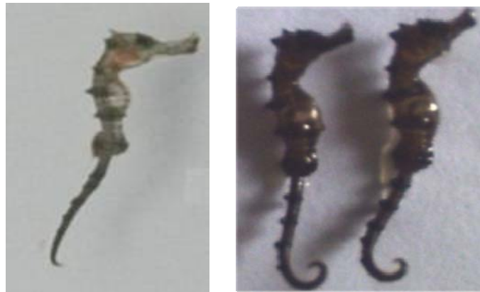
Fig. 1. Air ingestion by seahorse juvenile

Ingestion of air bubble into the gut was found to be the major cause of mortality during pelagic phase juvenile rearing. Seahorse juveniles while preying on live food organisms (copepods nauplii, copepodites and Artemia nauplii, etc.) engulf the atmospheric air if they miss the strike and this leads to formation of air bubbles in the digestive tract. The early juveniles are unable to release out the ingested air bubbles. Seahorse juveniles with ingested air bubbles exhibit irregular swimming pattern, lose their balance and are unable to capture prey, subsequently leading to starvation and ultimately to death.