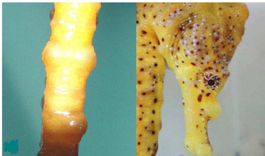
Fig. 2. External gas bubble disease observed in adult seahorse

External gas bubble disease (EGBD) may cause either due to gas super-saturation in the tank water or by bacterial infections where carbon dioxide produced by the bacteria becomes trapped underneath the skin. These subcutaneous (under the skin) air bubbles that may occur anywhere on the head, body, or prehensile tail of seahorse. The situation, wherein gas levels in the water are much higher than normally possible (caused by limited areas for gas escape), causes gas bubbles to form anywhere possible. Because the pressure inside of a seahorse is lower than the pressure of gas super-saturated water, the gas bubbles emerge directly under the skin of the affected seahorse. Since the air bubbles cannot pass through the skin, they remain stranded there until treated or until they can be reabsorbed by the seahorse's own body. The bubbles can cause stress on a seahorse as problems with buoyancy and movement arise.