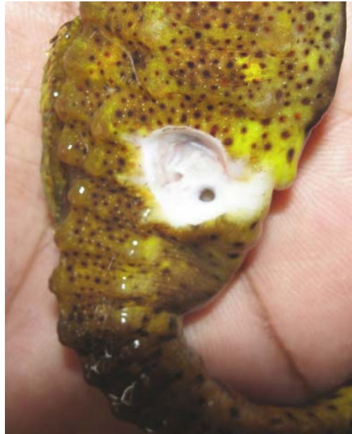
Fig. 3. Deep skin ulcer in Captive H. kuda