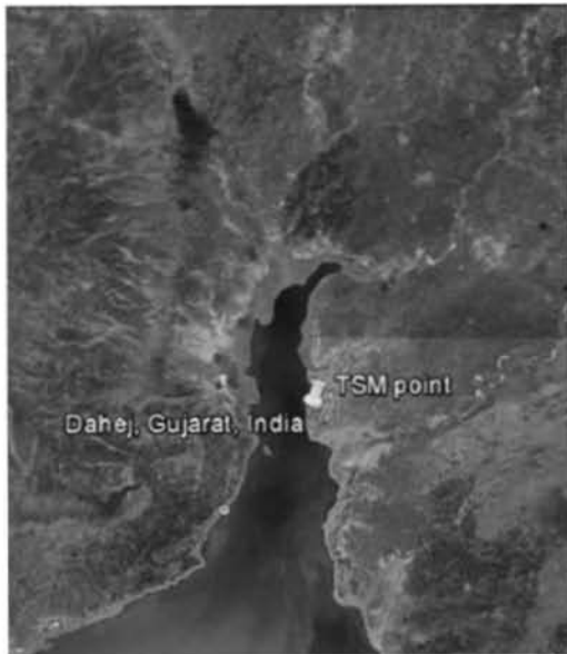
Fig. 1 West Coast of India

In the present study, a coastal location with geographical coordinates of 21°43'10" N and 72°30'25" E, off Dahej, west coast of India was selected (Fig. 1) Water depth at this location was around 16m.