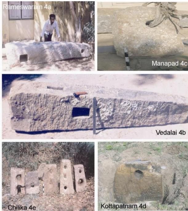
Fig. 4 Types of stone anchors found along the east coast of India. (Sila Tripathi and N. Athiyaman)

width and thickness of the anchor are 76 x 77 x 27 cm and weight could be about 250 kg. From the archaeological finds of Kottapatnam and a comparative study of stone anchors recorded from other sites of India, the stone anchor of Kottapatnam can be tentatively dated to the medieval period (Sila Tripathi et al., 2014).