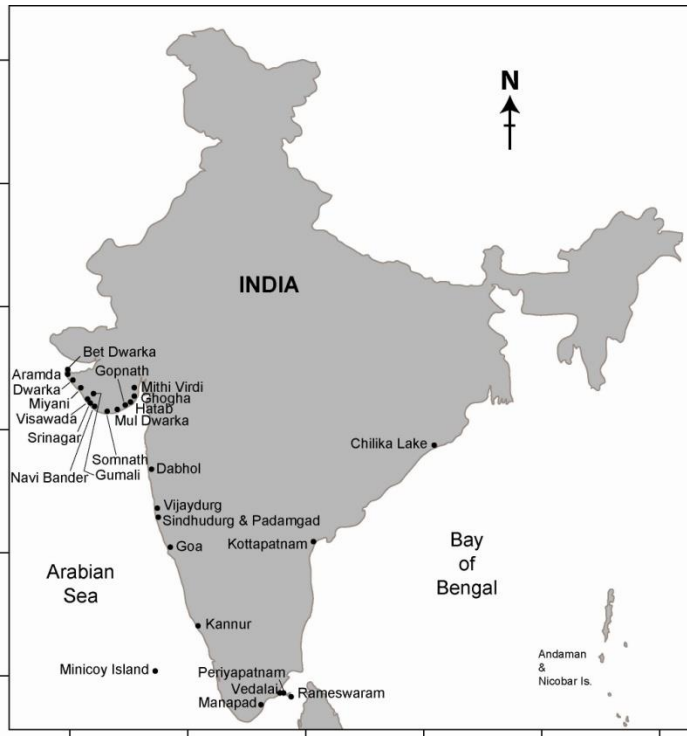
Fig. 1 Map showing the stone anchor sites in India. (Sila Tripati)

from the anchors which were found during maritime archaeological explorations. A