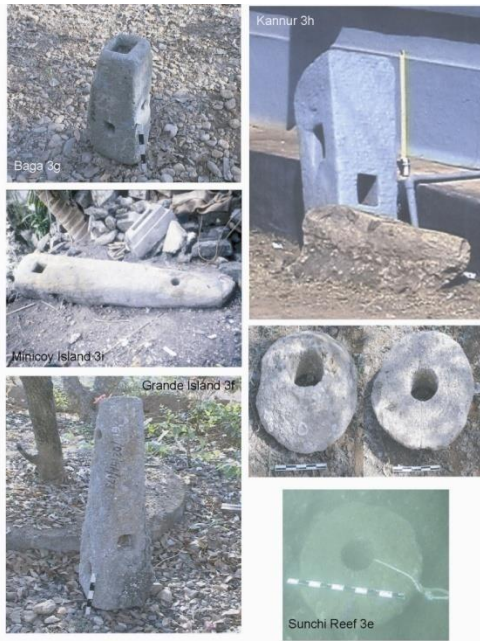
Fig. 3 (e-i) Types of stone anchors found along the Maharashtra, Goa, Kerala and Lakshadweep coast of India. (Sila Tripati)

its estimated weight is 1522 kg. The other Indo-Arabian anchor has lower holes and rope hole is missing. It is made of greywacke sandstone and the estimated weight is 178 kg. The Indo-Arabian type stone anchor which was found near the mosque of Vedalai (Fig. 4b) is made of granite. The fluke holes of the anchor are present whereas the rope hole is missing. Marine growth and chisel marks are visible on the anchor. Its maximum length is 181 cm and weight is 520 kg. The trapezoidal type of stone anchor found in the