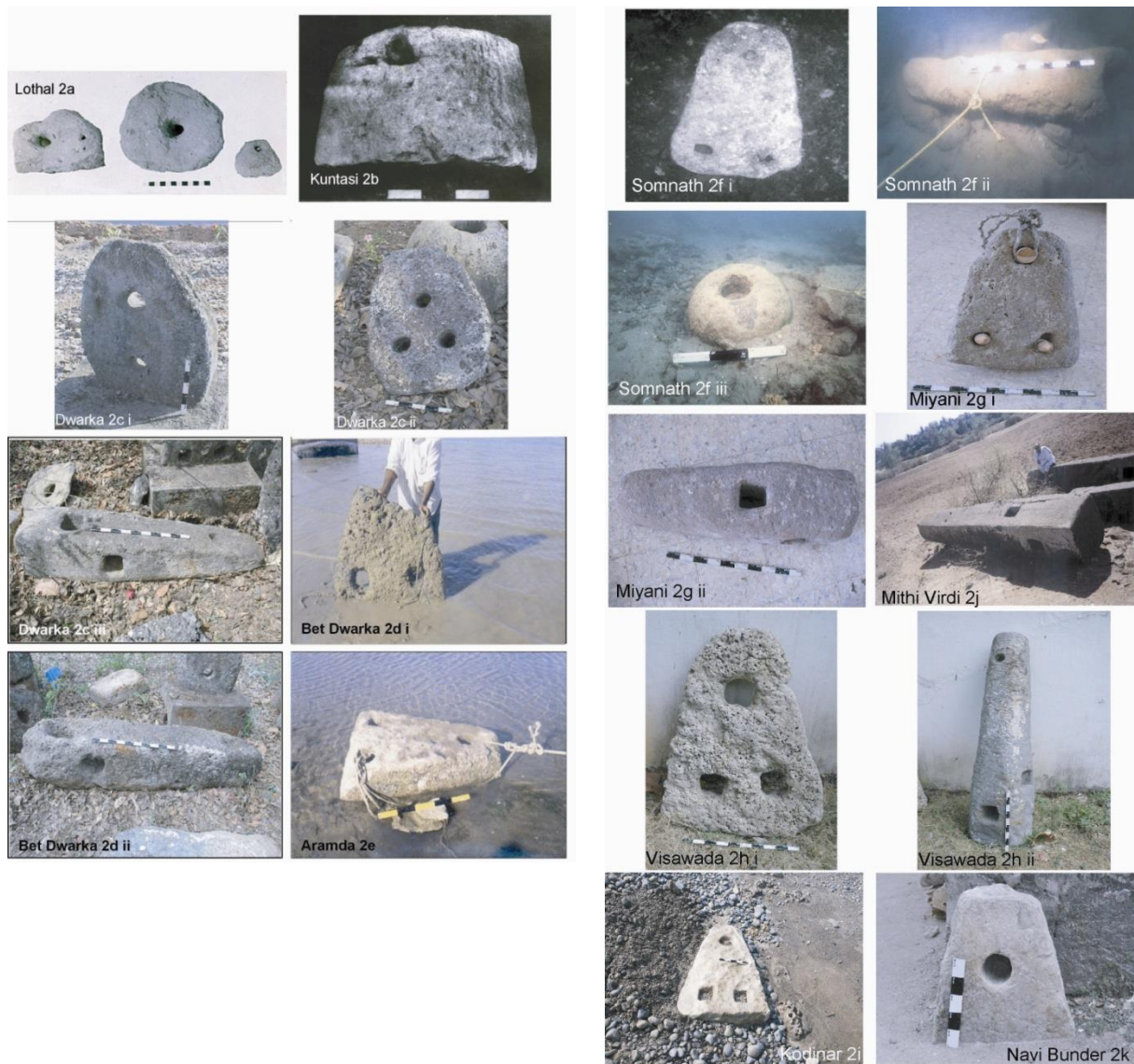
Fig. 2 (a-e) Types of stone anchors found along the Gujarat coast of India. (Sila Tripathi)

Manapad); Andhra Pradesh (Kottapatnam); Odisha (Kanas, Chilika Lake); West Bengal (Harinarayanpur).