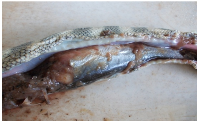
Fig.4 The half-digested fish (catfish sp.?) being removed from the gut of E. schistose