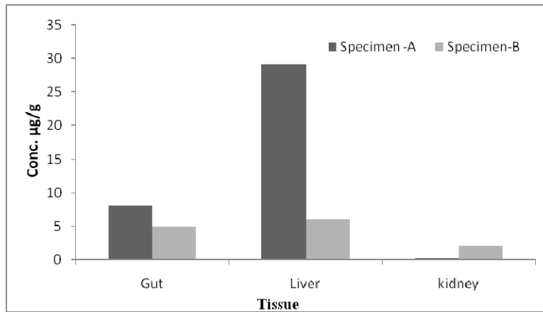
Fig.3 Total n-alkane concentration in the different tissues of E. schistose