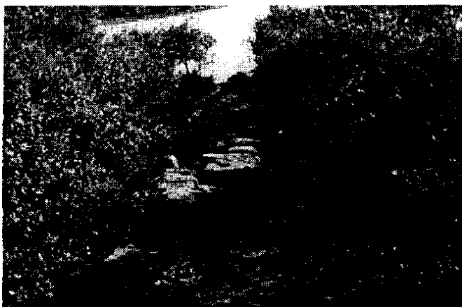
Fig. 5: Partially submerged jetty (No. 4) along the Porbandar Creek

several Harappan and historical period ports, no significant remains of ancient ports or habitation sites of the protohistoric period were recorded around Porbandar. The discovery of a late Harappan site at Porbandar has added a new dimension in the study of the Harappan domain in the Gujarat. The site is locally known as Kotada Bandar . Bandar means a port, and it is very likely that areas close to the creek, boats may have been berthed about 3500 years ago. The site would have been an important port during the late Harappan period. The pottery is very similar to Rangpur IIC (Rao 1963) and Bet Dwarka (Gaur and Sundaresh 2003). From the section it appears that the total habitation deposit is not more than 1 m; similar to late Harappan deposits at Bet Dwarka. The discovery is also significant as it suggests that the late Harappans continued to stay near coastal areas to exploit resources from the sea; this being their main economy. As per local information, an ancient jetty was situated near the site and about 500 m away from the creek. It is likely that during the Harappan period, the creek extended up to this point. On the basis of a comparative study, the late Harappan habitation at Bhokhira can be dated to between the 16th and the 14th century B.C.