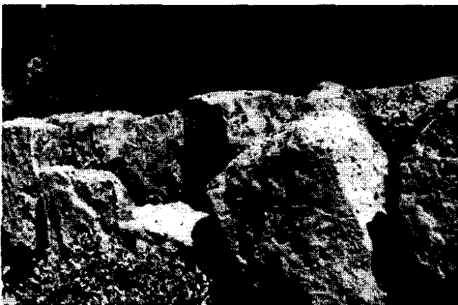
Fig. 3: Remains of an ancient jetty (No. 1) along the Porbandar Creek

Explorations around Porbandar brought to light interesting findings about the maritime activities of the region. Although the Saurashtra coast has witnessed the rise of