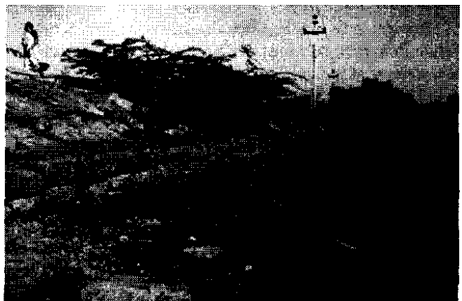
Fig. 4: Ancient jetty (No. 2) along the Porbandar Creek