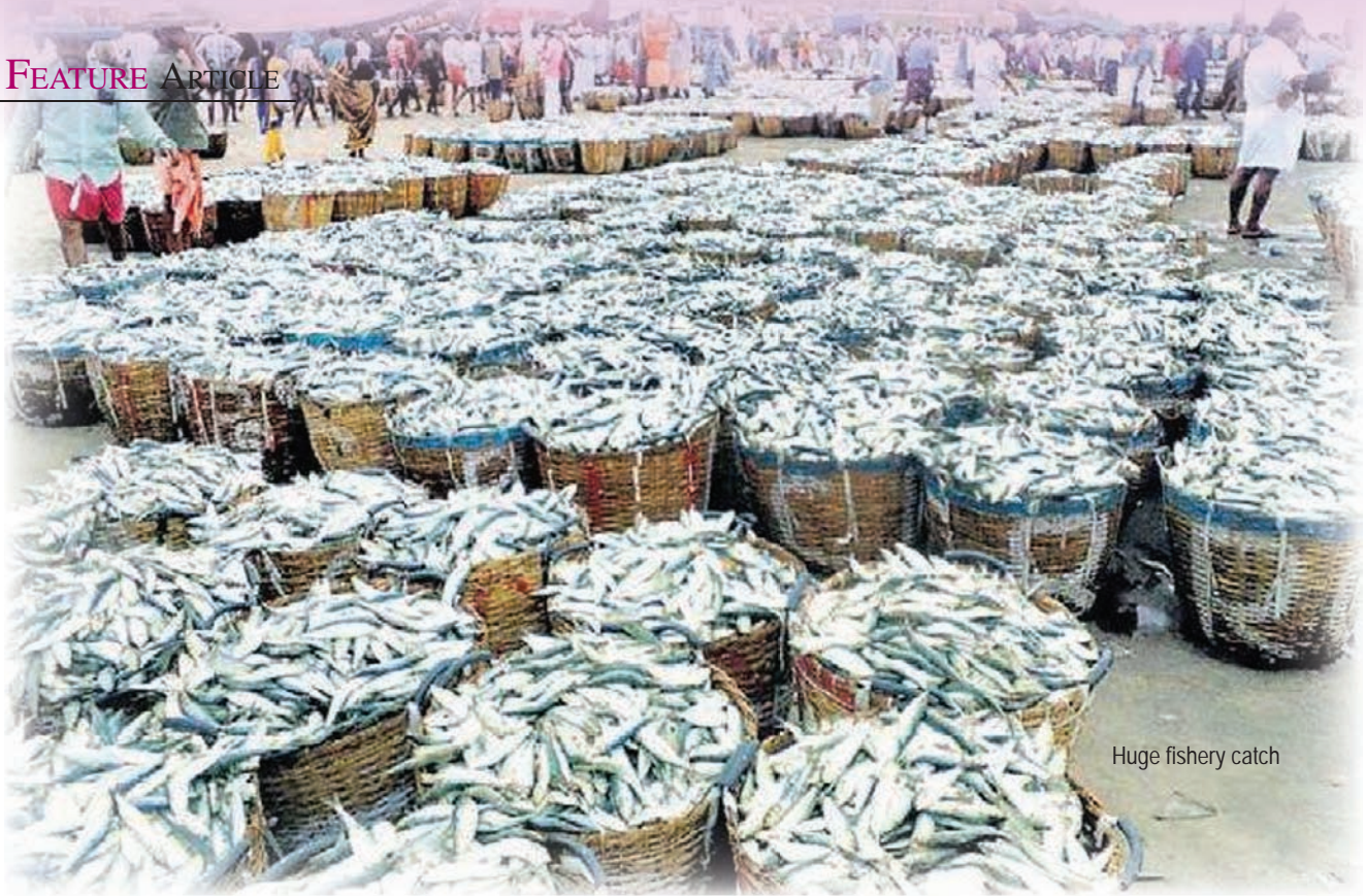
Huge fishery catch