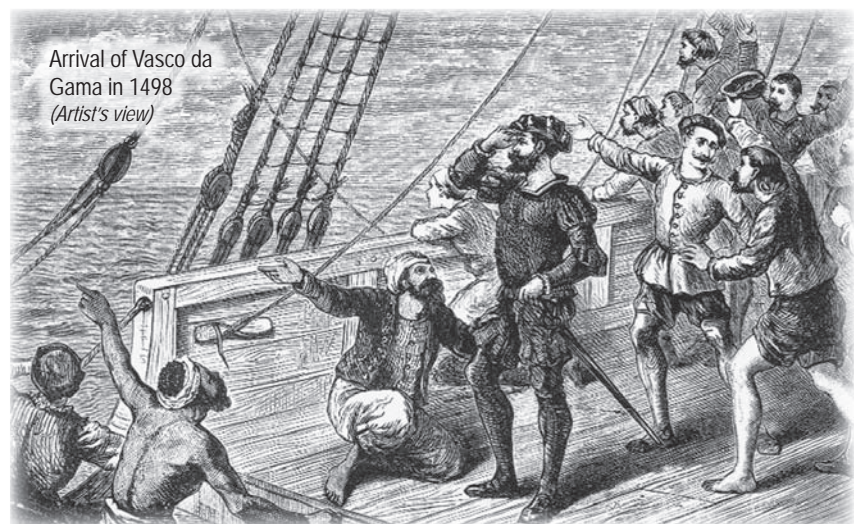
Arrival of Vasco da Gama in 1498 (Artist's view)