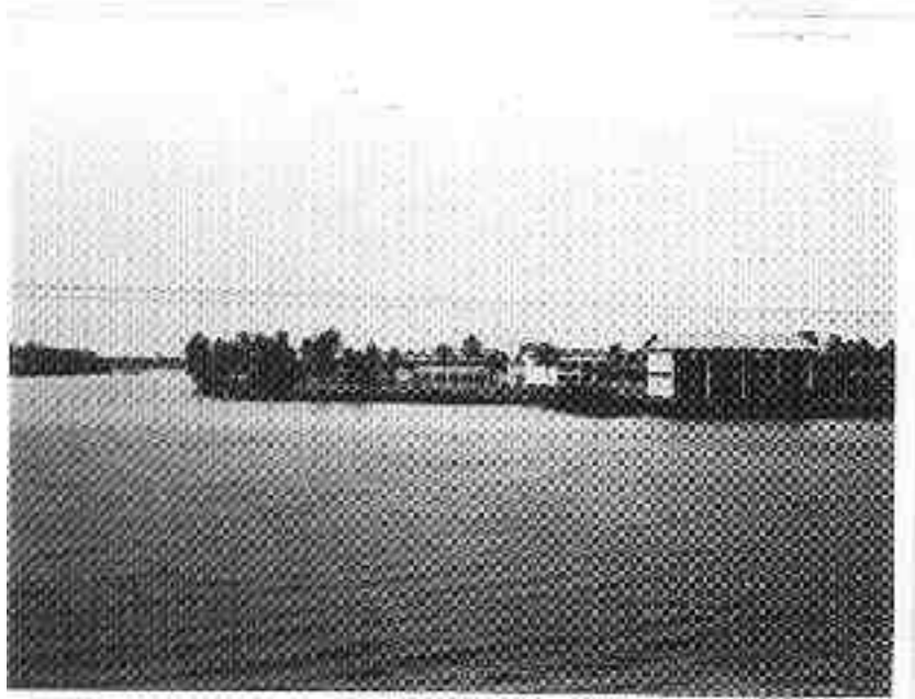
Figure 3. Lowlands along the northern bank of river Sul at Assolna have been filled and reclaimed for tourism-oriented activities. A mangrove lined bank is converted to a built up bank resulting in reduction of mangroves and wetlands (August 1996).