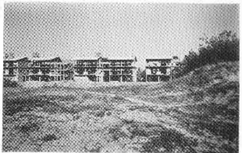
Figure 4. Several rows of sand dunes have been razed to make place for residential units at Miramar. Coastal sand dunes now perform the functions of a residential area (February 1993).

local planners have admitted that tides indeed occur in the rivers.