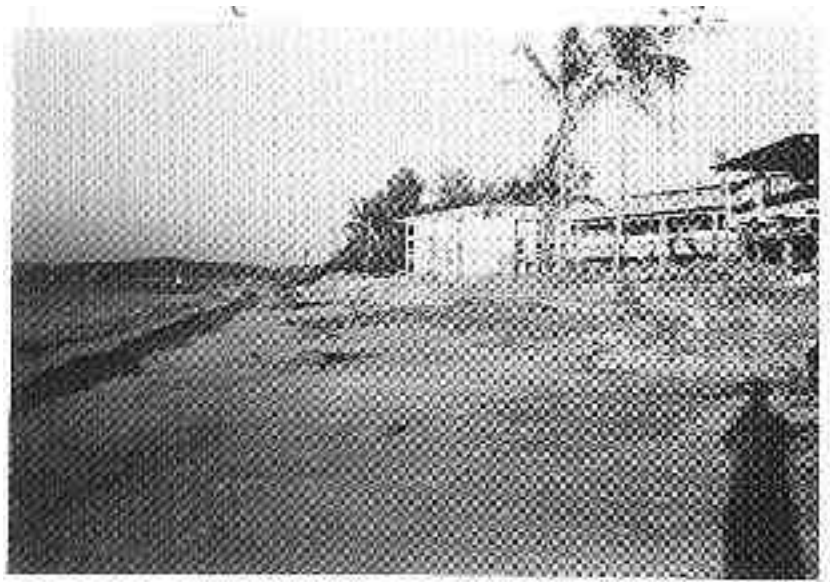
Figure 2. A resort under construction on a dune, a few meters from the water line in the Mandovi estuary, at a place prone to severe erosion. The small sandy strip remains submerged at high tide confirming that the original beach has completely eroded (December 1997).