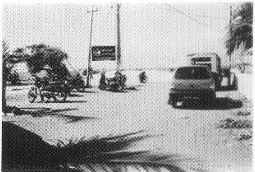
Figure 5. A large dune area has been flattened, and is used as a parking lot at Candolim. Such anthropogenic activities uproot vegetation, render sand loose, and result in its excessive mobility wherein sand then blows inland (December 1997).