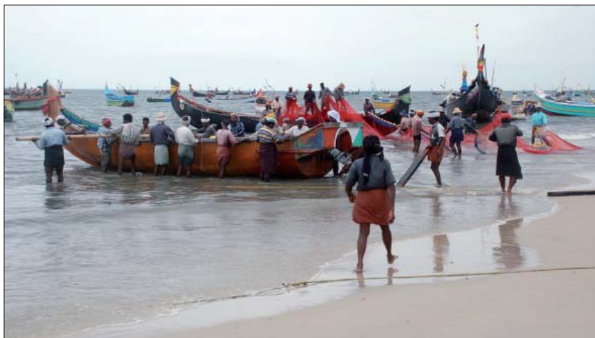
Sheer monsoon fishery magic! Mud banks are tranquil marine areas hugging the coast, which develop during the roughest monsoon period