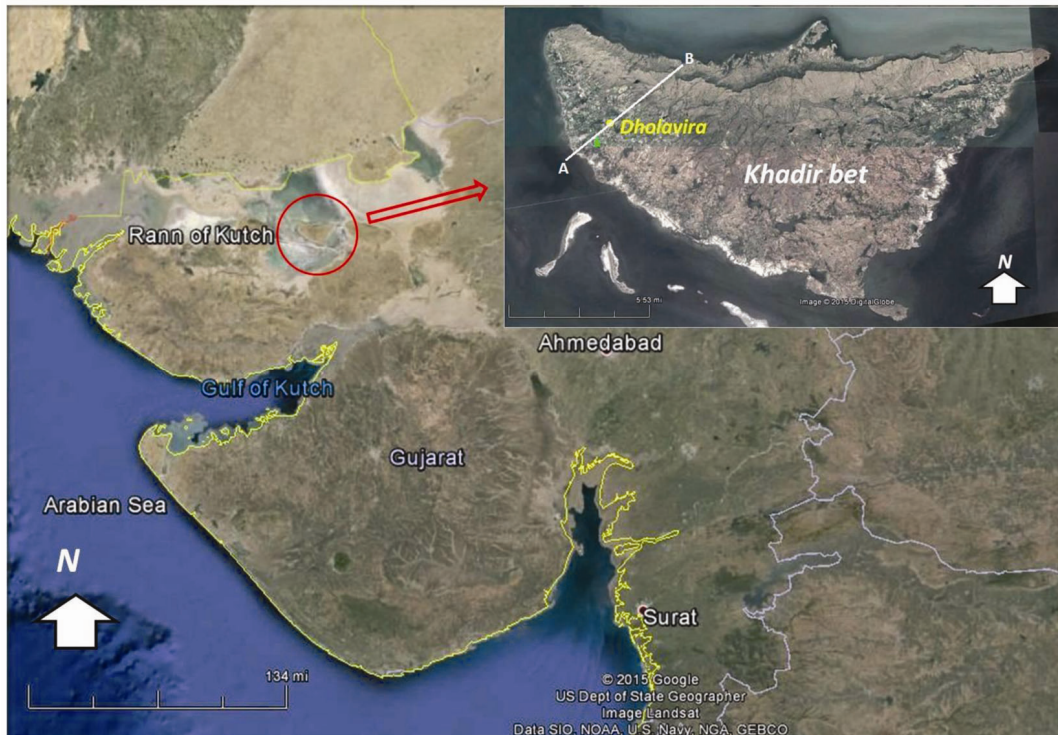
Figure 1. Location map of Dholavira, Gujarat, India (image modified from Google Earth). A–B is the line along which elevation has been measured in the study.

introduction in India 14 was much later than the timing of the Dholavira settlement. The bastion and gateways in the wall at Dholavira need an explanation as well. Bastions could have served the purpose of conveying important public warnings apart from providing strength to the walls. The gateways being flanked-type 2 served the purpose of public movement for trade and commerce, since such gateways are considered vulnerable to military attack 15 . In short, these wall structures which are in general associated with military defence did not serve the same purpose at Dholavira. Instead, they served some social purpose 15,16 .