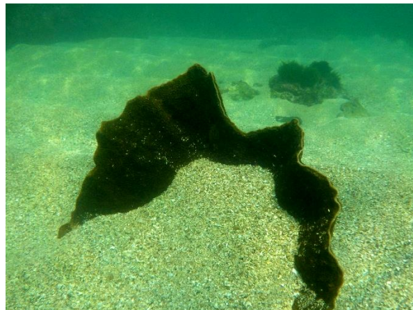
Fig 2: Damage coral Turbinaria mesenterina by recreational dive boat anchoring

activity 91 . Furthermore, anchoring of tourist boats can also cause coral damage (Fig. 3, personal observation in MMS). Hence, regular impact assessment of recreation activity on reef ecology is needed to adopt sustainable tourism practice.