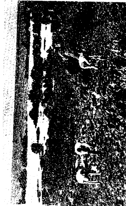
Fig. 3. Rock pools in Malvan Bay where living corals are found growing on rocks.