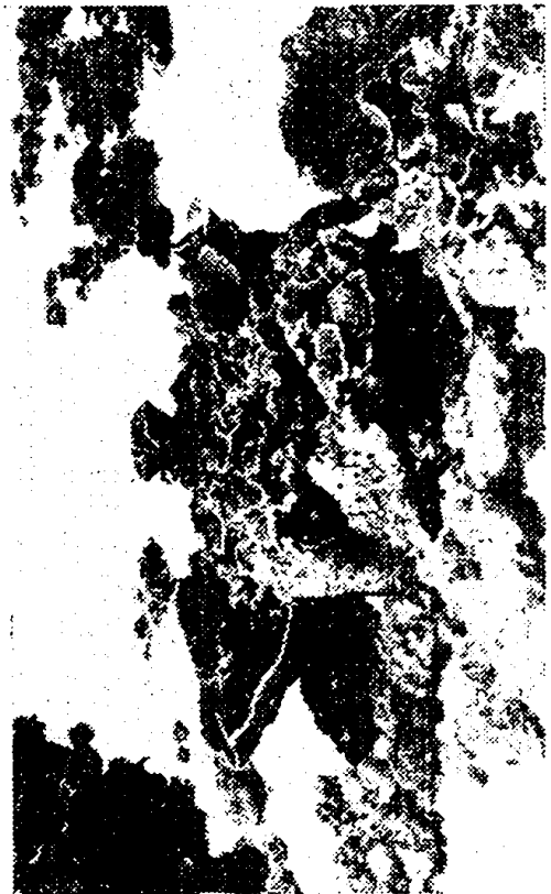
Figs. 1, 2, 3 & 4 (Clockwise). Coral colonies and calcareous algae photographed under water at Malvan