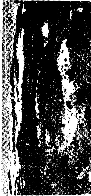
Fig. 1. Malvan Bay at low water.