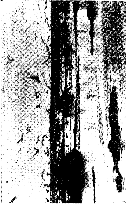
Fig. 2. Bird life at Malvan Bay.