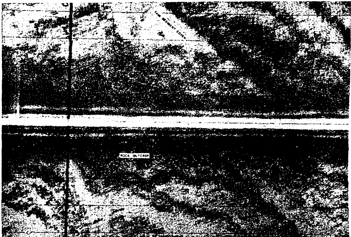
Picture of the sea bed taken by R. V. Gaveshani using a side scan sonar. Sediment cover (sand and clay) is recorded in light-tone and rock outcrops in dark-tone.