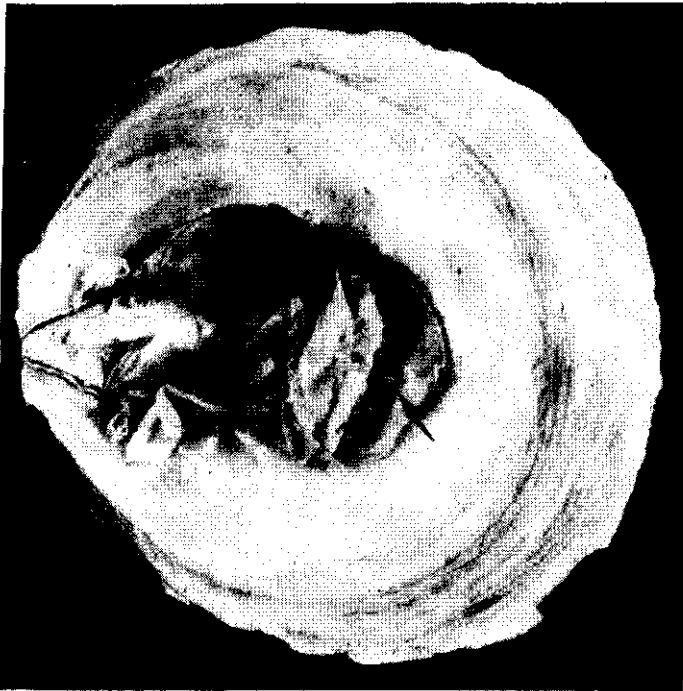
Fig. 1. A Windowpane oyster showing pearl inside the mantle. Arrow indicates the position of pearl.