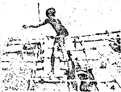
Fig. 3a Frame-net containing pearl oysters being lowered in water.

During the last few years very encouraging results have been obtained on composite fish culture of freshwater crops, resulting in a very high annual yield of 8750 kg/ha. Rope culture of mussels from floating rafts (Fig. 1a) in estuarine and coastal waters, with a possibility of three crops per year, has shown a phenomenal yield of 480 tonnes/ha/year. It has a rate of return of 181% on a low initial investment of Rs.2,500. Similarly, the giant edible oyster, when grown in frames or in bags made of nylon net hung from floating rafts or from ropes in an estuarine farm (Figs. 2a and 2b) has led to a 40% reduction in time in attaining commercial size as compared to the period it takes to grow in its natural environment.