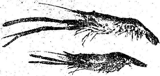
Fig. 4 Male (larger) and female (smaller) of the giant clam.

India will largely depend upon the availability of substantial assistance in the form of inputs including credit facilities to fish farmers and technical guidance from marine scientists. Besides financial and technical assistance, a liberal leasing policy of suitable wetlands is also necessary so that fish farmers do not have much at stake at least in the initial phase of the development of aquaculture.