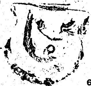
Fig. 3b A cultured pearl showing a feature in the tissue by arrow.