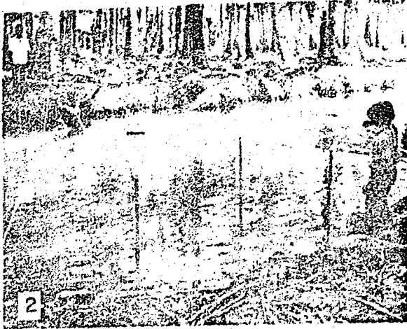
Fig. 2a Oyster bags hung from nylon ropes in an estuarine farm

As compared to mechanised fishing, aquaculture can be carried out using inexpensive gadgets and simple techniques. The advantages of aquaculture as compared to traditional fishing are: