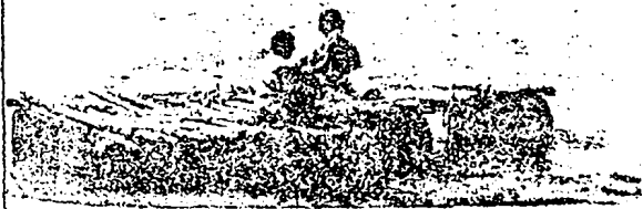
Fig. 1a Raft made of wooden frame and bamboos used for the cultivation of mussels on hanging ropes in Goa.