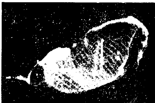
Fig. 2. A single zooid of the colony of P. atlanticum , 5.5 mm.

was collected in a vertical haul of HT net from 200 m. The colony was preserved in 10% formalin and later identified as P. atlanticum . The soft gelatinous transparent mass was 50 cm long, 30 cm wide and 6 mm thick. A portion of the colony of 5 cm × 5 cm was found to have a volume of 5 ml and comprised of 520 individual zooids of size ranging from 0.5 mm to 5.5 mm (Figs. 1 & 2). There was no definite pattern in the arrangement of the zooids of different sizes.