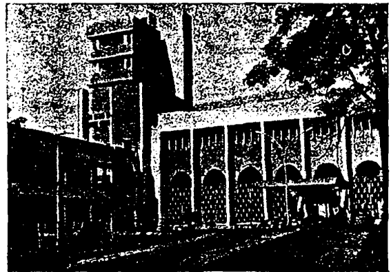
Fig. 1. National Institute of Oceanography, Dona Paula, Goa.

The work started by the Surgeon-Naturalists gradually spread in the country and resulted in the establishment of marine biological studies in the Zoological Survey of India. The Fisheries Departments of the coastal states started work on marine aquaria and museums. Soon afterwards, marine biology began to be taught in some of the Indian universities. All these acti-