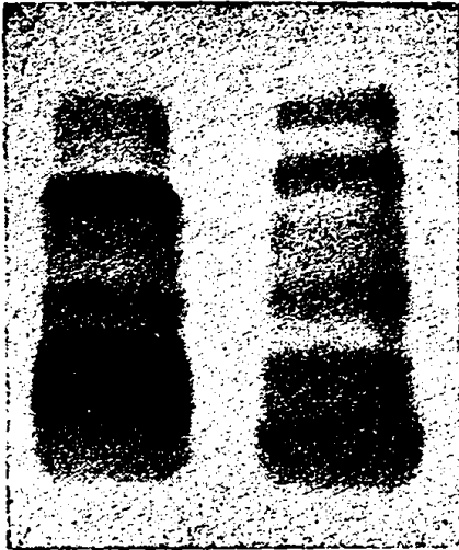
Fig. 1. Serum protein electrophoresis patterns in B. orientalis and P. arsius .

fractions 1, 2, 3 and 5 are the major protein fractions. The eye lens pattern of B. orientalis consists of 6 fractions, of which 1 and 2 are the major proteins. Eight fractions are present in the eye lens of P. arsius fractions 1, 2, 3 and 6 are the major protein fractions. The differences remain constant and exhibit remarkable species specificity.