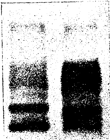
Fig. 2. Eye lens protein electrophoresis patterns in B. orientalis and P. arsius .