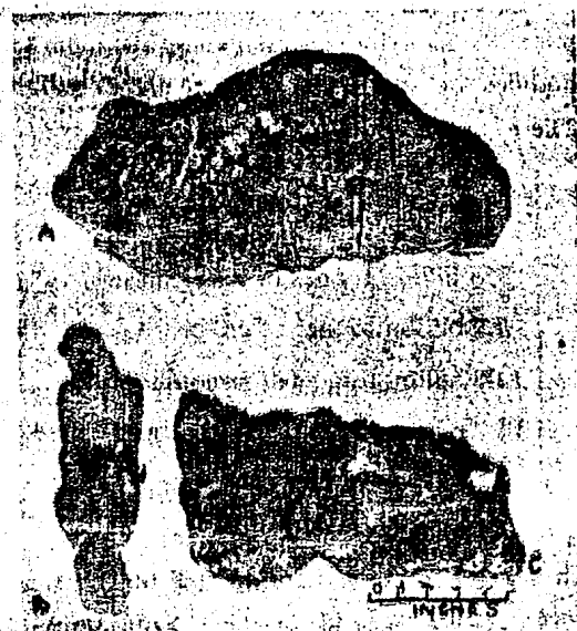
Fig. 3. Phosphorite nodules from the Pacific Ocean. A. Large nodule weighing 128 kg. B. & C. Smaller nodules.

Indonesia and Malaysia. Iron is being recovered from submerged deposits of Japan. Diamonds are also being recovered from shallow water deposits of South-West Africa. Surface mineral substances are also available in the form of phosphorite and manganese nodules (see Figs. 3 & 4). The manganese