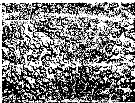
Fig. 4. The much publicized manganese nodules which range from 2-8 cm in diameter.