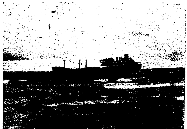
The American oil tanker Transhuron which ran aground in the Lakshadweep Sea at Kiltan and spilled several thousand tonnes of furnace oil in the sea.

In July 1973, off the Gujarat coast, Cosmos Pioneer ran aground spilling about 3,000 tonnes of light diesel oil. This resulted in mortality of marine life around Porbunder area. In September 1974, an American oil tanker Transhuron carrying 18,500 tonnes of furnace oil ran aground at Kiltan in the Lakshadweep Sea, spilling 3,325 tonnes of furnace oil and adversely affecting the marine life in the vicinity of Kiltan Island.