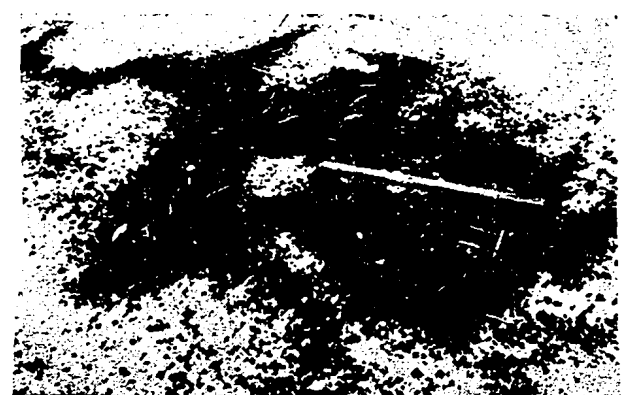
The oil pollution finally takes the shape of bigger tar balls and slicks. These tar balls are difficult to remove from human feet and shoes where they invariably adhere.