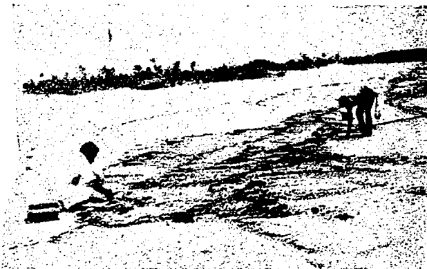
Oil pollution at one of the beaches of Maharashtra.