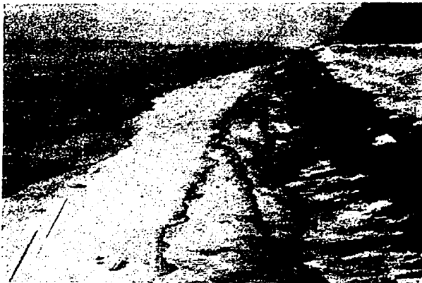
Tar-like deposition appeared on the beautiful beach of Kiltan and caused considerable mortality of marine life.