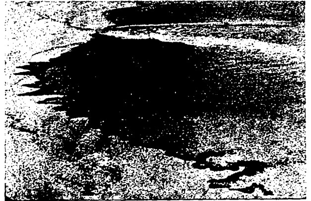
Candolim beach, Goa, showing thick deposition of tar balls during the monsoon season.

The tar ball deposition along the Goa coast has been studied by NIO in greater detail. Of the 24 Goan beaches inspected regularly from 1972 to 1974