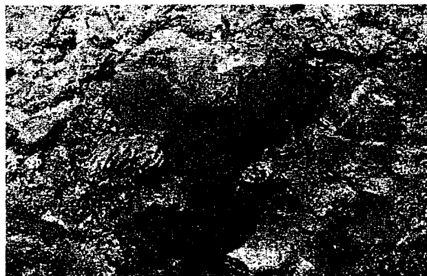
Thick layers of oil appeared in rock pools at Kiltan as a result of oil spill.

the sea, these get dissolved into the water rapidly. Other oils like the lubricating oil, motor oil and residual fuel oil are very thick and heavy. At tropical sea temperatures these form slicks which either sink to the bottom or keep floating. The oil also forms emulsions and very often it may give rise to grease-like consistency and produce 'mousse'. The Torrey Canyon slicks took 23 days to reach the English beaches. It has now been established that apart from the spreading character of the oil, its mechanical transport by wind, tides and currents determine the magnitude of coastal pollution.