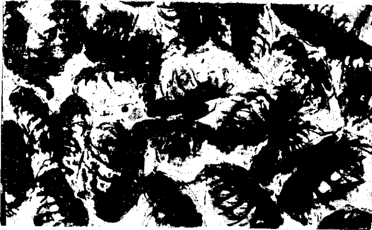
Fig. 3 A swarm of Penilia avirostris