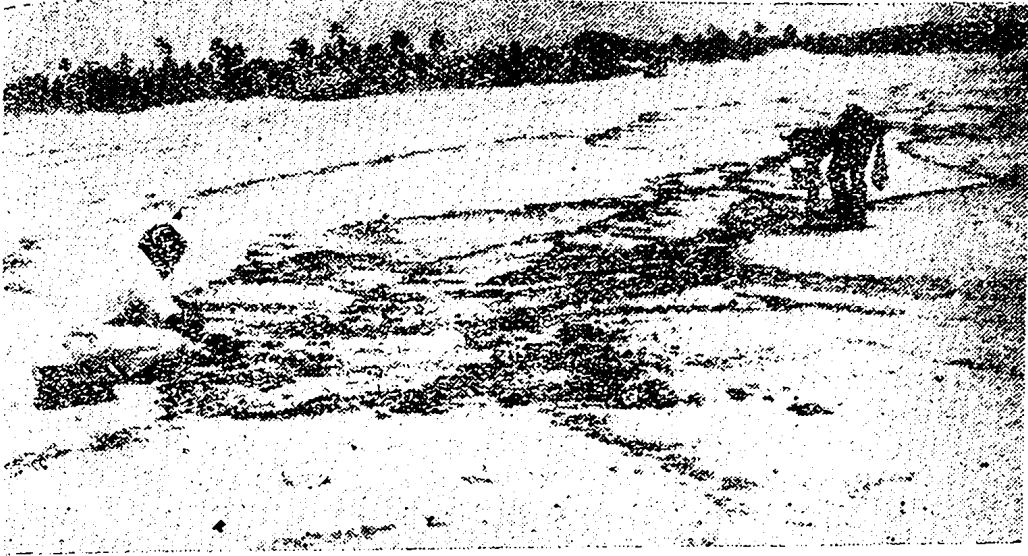
Fig. 2. Oil Pollution at Sinquerim beach. Tar deposition seen at different tide levels.

preliminary results (Untawale et al. 1973) indicate that the mangroves do not grow in the lower reaches of estuaries where wave action is high, the bottom is rocky or sandy. In the middle reaches where wave and tide action becomes less pronounced, the mangroves start growing and establish their typical species associations. In these regions the bottom is swampy and fishing or other avocations become very difficult. The special root system loosens the soil which continuously add to silting and can adversely affect navigation. These areas with proper management practices can be profitably used for various purposes, including development of food resources.