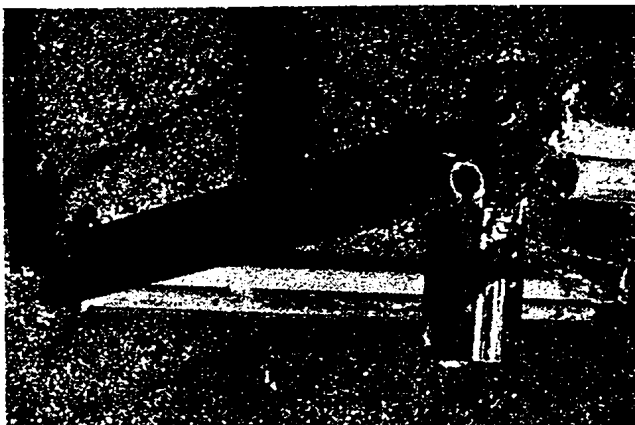
Square frame seen from below with groove for easy rigging of the net, added in this model

collar the filtering portion has four straight quadrants which run parallel to the frame, each 10 cm long and 51 cm wide. This portion is joined to the filtering cone of four quadrants each of 140 cm long and 50 cm wide. The cod end of the filtering cone is cut to accommodate a collecting bucket of 7.5 cm diameter through a collar of 8 cm sail cloth. Each quadrant is overlapped to give strength at the seams and is reinforced by nylon tape. Over the tape, 8 mm thick nylon rope is fixed to act as a rib rope, the free end serving to secure the net to the frame and the cod end to the bucket.