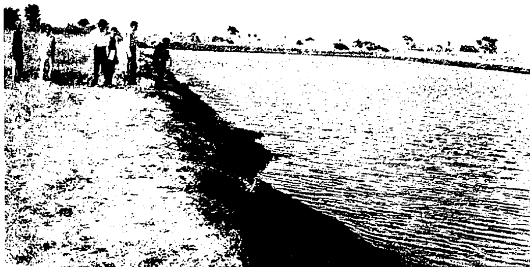
Another view of the Lothal dock; the figures on the left are standing near the western embankment. The loading platform on the western side, measuring 240 metres long and 23 metres wide, now submerged in water, was used for hauling goods. The extreme end of the dock shows the northern embankment.