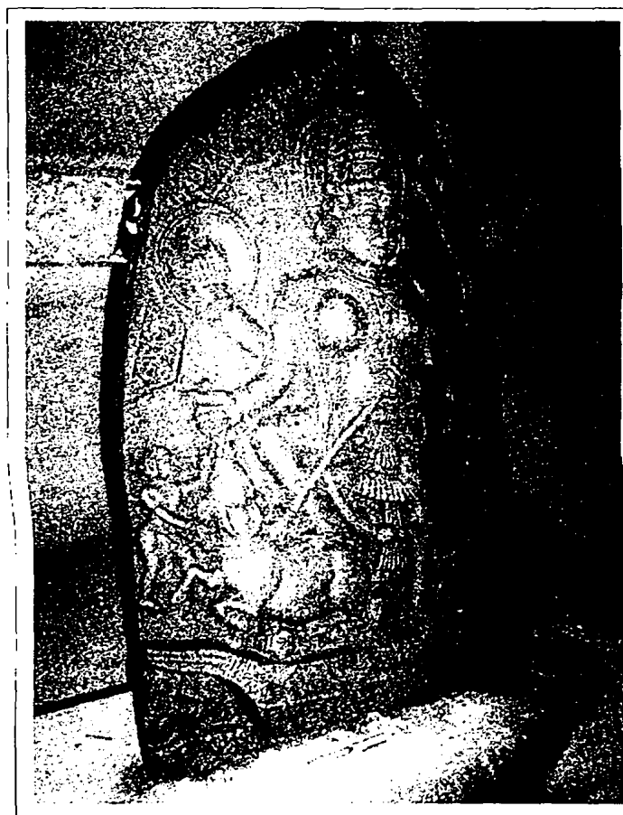
Fig.2. Mahishasuramardini on the boat from Shell-Melawali

The representation of the boat is different from the earlier one. This finely carved boat is comparatively smaller in dimension. Prow and stern is slightly higher than the rest of the boat. Two oars and five people are present in the boat. The boat has regular vertical lines (Fig. 1) and appears to be a flat-