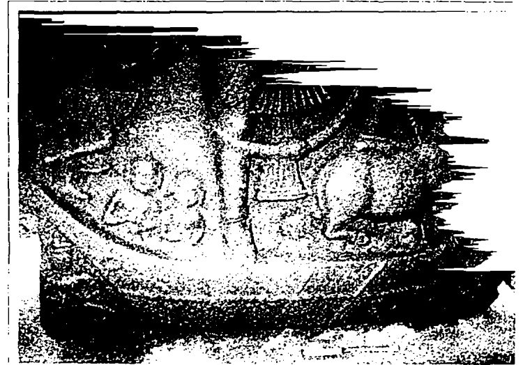
Fig.3. Close-up of the boat portion from Shell-Melawali

A big temple-complex, known as Jalmidev temple, is located in an isolated area of Shel-Melawali. A complete panel of sculpture,