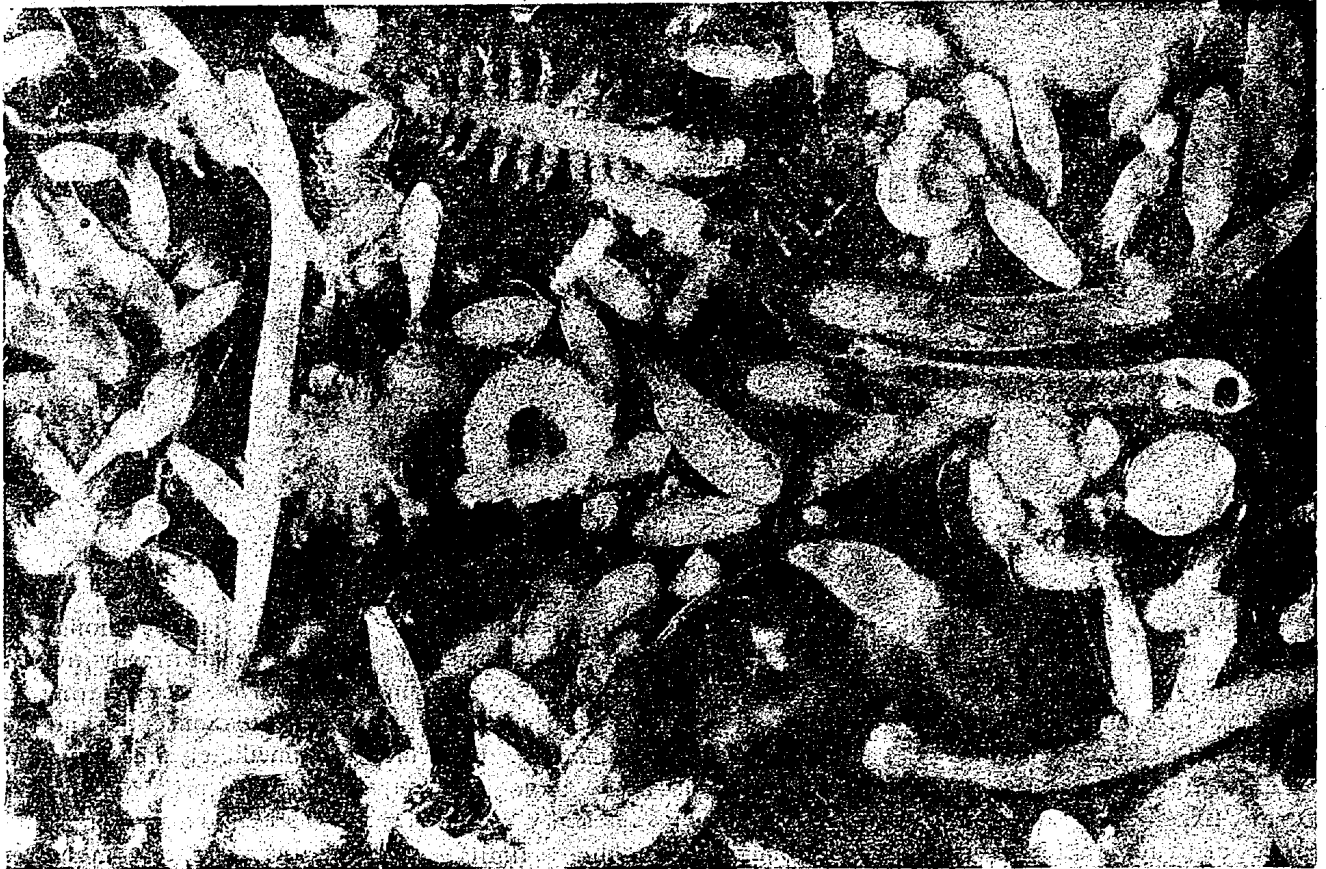
Fig. 1. Showing the Zooplankton Community

the production is the lowest (Fig. 2). The region between longitude 40^{\circ} - 65^{\circ} E and latitude 6^{\circ} - 12^{\circ} N is believed to be an area of divergence of currents and centre of a gyral. Such areas of divergence are known to be poor in zooplankton population and in this particular region the layer of minimum oxygen also is believed to be brought near the surface causing certain deleterious effects.