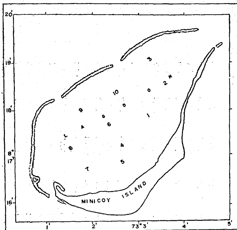
Fig. 2. Location of sampling stations in Minicoy lagoon

agar slants. A total of 134 isolates were obtained in pure cultures (54 from offshore marine and 80 from lagoon) and were subjected to 23 tests following the identification scheme of Sakazaki (1967), modified by Kaneko (1973) to confirm their identification as Vibrio parahaemolyticus (VP).