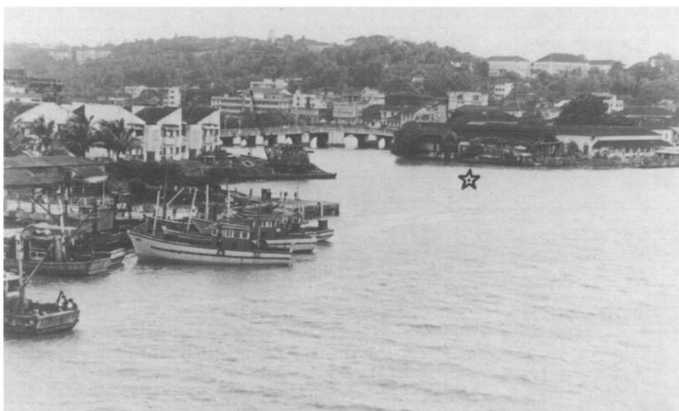
Fig. 1 Photograph of site SW1 showing the opening of the nullah and the fishery jetty.

Table 1 summarizes the environmental parameters studied at the two sites. Both sites were situated in shallow waters, the bottom having moderately sorted fine median particles with high percentage of silt clay. The percentage organic matter of the sediment was higher at SW1 than at site SW2. The salinity and dissolved oxygen values of the bottom water at the two sites were sufficiently similar while the \text{BOD}_5 values indicated higher microbial activity at SW1 site. In general the environmental parameters did not vary significantly and therefore the two sites are comparable. It may be pointed here that the organic matter and \text{BOD} values do not suggest any severe pollution due to